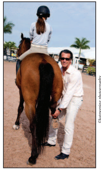
Flexing the right hock

The hock is an even more complex joint consisting of 5 separate joints and 7 bones (not including the tibia and cannon bone).